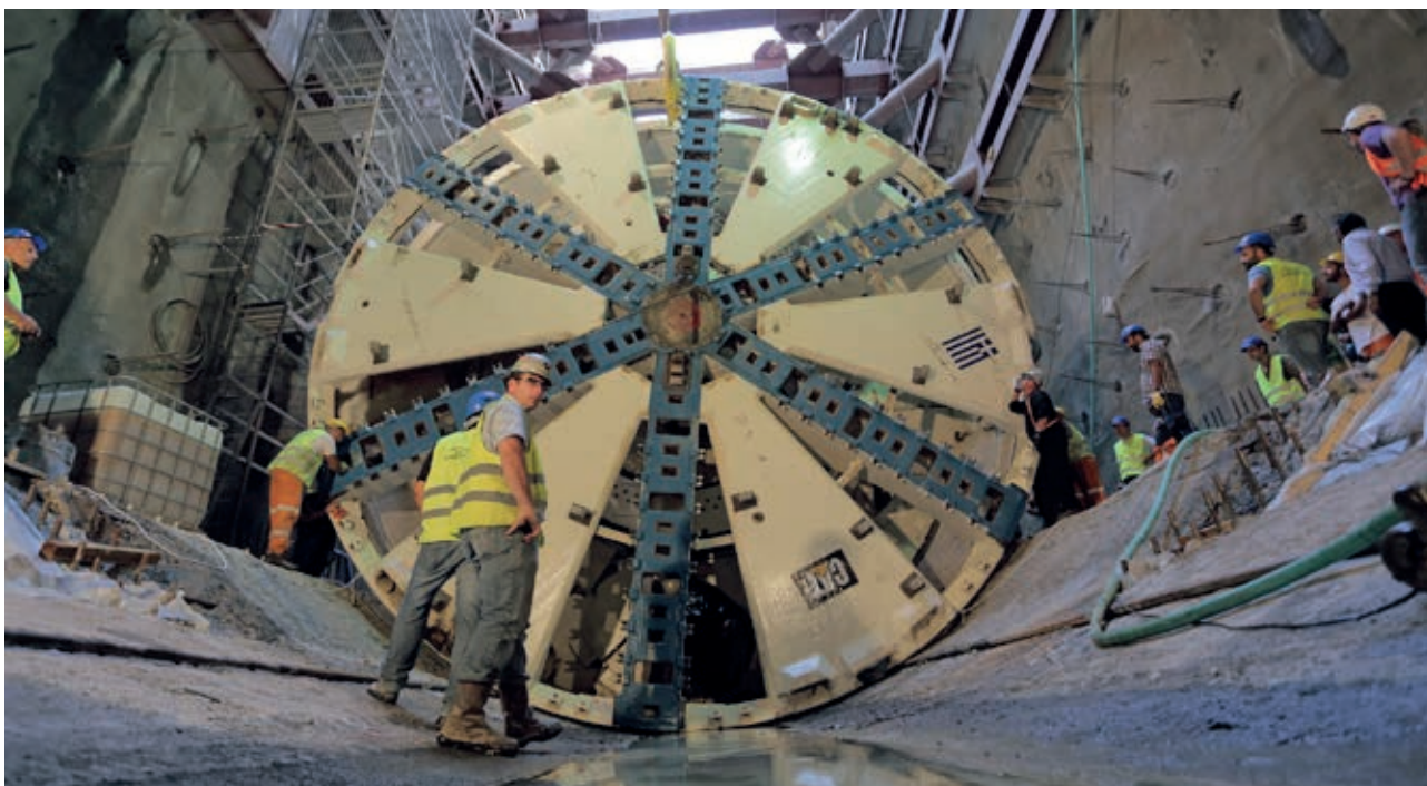
New Athens metro line to ease commutes and cut emissions with the support of a €730 million EIB loan.