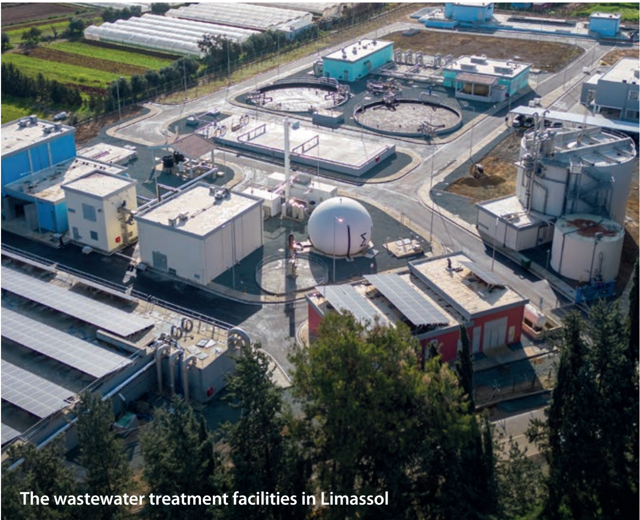
The wastewater treatment facilities in Limassol

The new €100 million investments in water management were signed in December 2023. They are a significant step in helping to move Cyprus towards full compliance with the EU Urban Wastewater Treatment Directive . The projects will fund the preparation and construction of sewerage networks and treatment facilities for peri-urban communities in the three largest cities in Cyprus, Nicosia, Larnaca and Limassol . Cyprus is one of the most water-scarce countries in the world. It has limited freshwater resources, but demand for water is increasing. While improving service efficiency, the new operations will also have other environmental and public health benefits, such as avoiding surface and groundwater pollution.