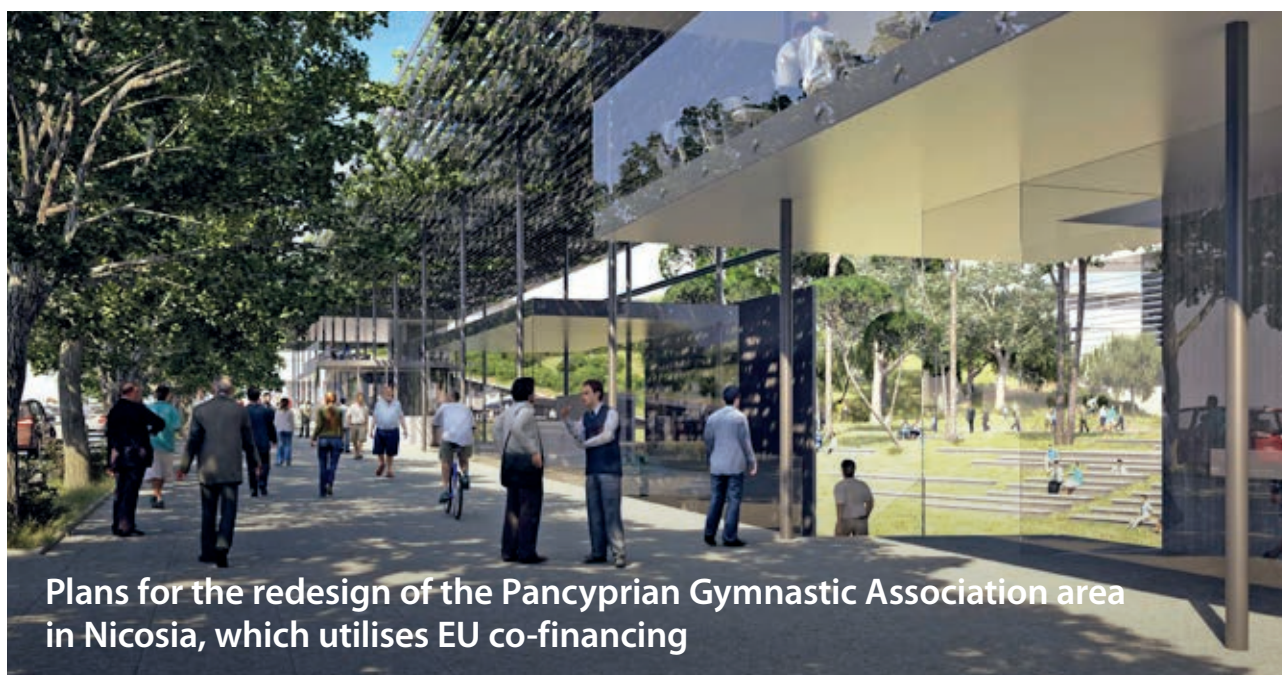
Plans for the redesign of the Pancyprian Gymnastic Association area in Nicosia, which utilises EU co-financing

EIB Advisory has further expanded its already significant presence in Cyprus by providing technical assistance to the public and private sectors in important infrastructure projects relating to the environment, transport, climate, digital innovation and urban development. A key objective for EIB Advisory's activity in Cyprus is to maintain a strong link with EU policy priorities and an investment project focus, and this is offered independently of EIB lending activity. There are currently five active assignments and three recently completed assignments in Cyprus. The highlights of advisory support in 2023 included assistance with the establishment of an efficient organisational and governance structure, as well as robust industrial safety procedures, for the Vasilikos Energy Centre , an assignment worth €1.5 million . EIB Advisory also handled the implementation plan for the operation of the New Cyprus Museum , to be financed by the EIB in 2024.