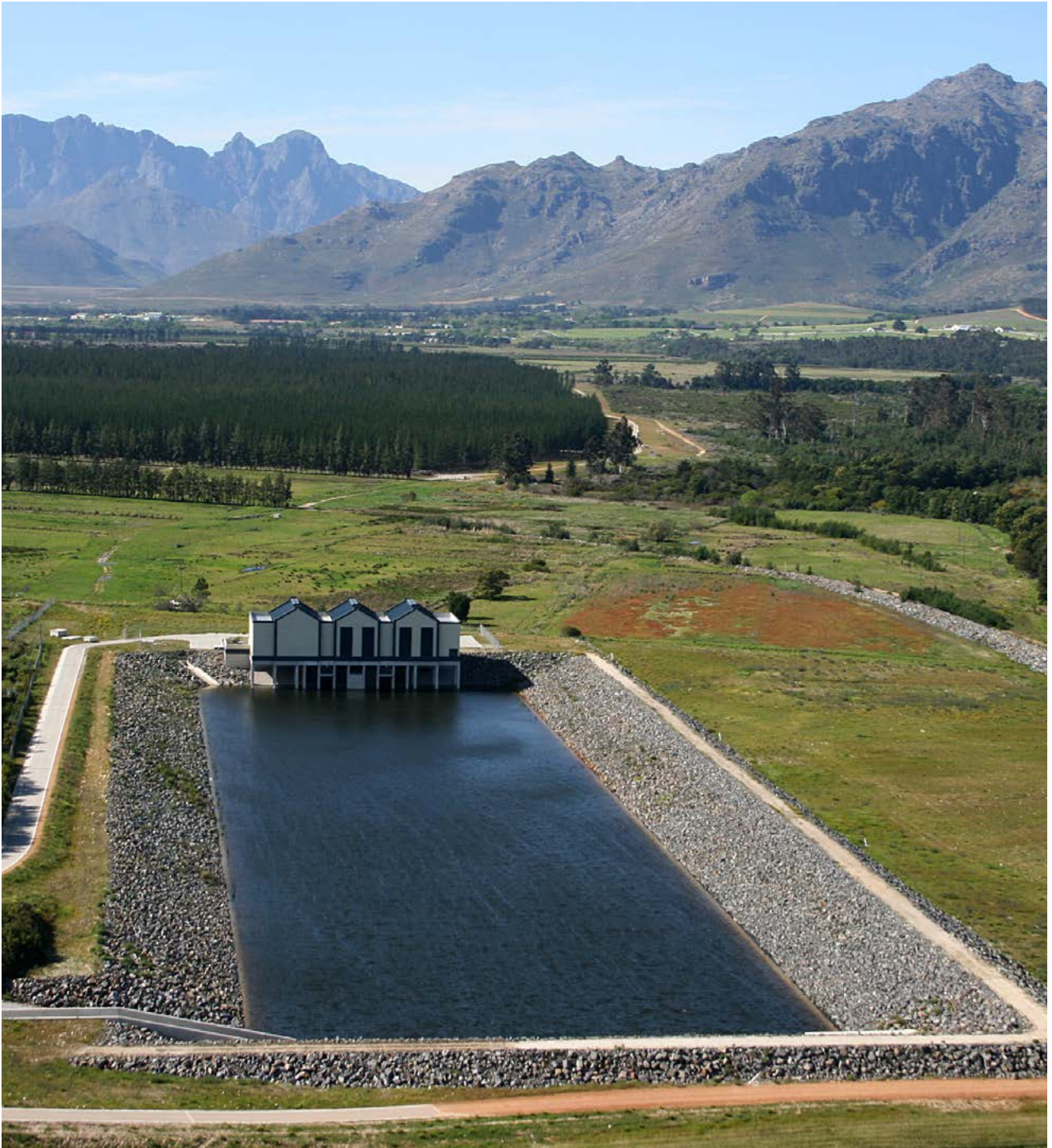
A dam on the Berg River improves water supplies for 3.2 million people in Cape Town, South Africa.