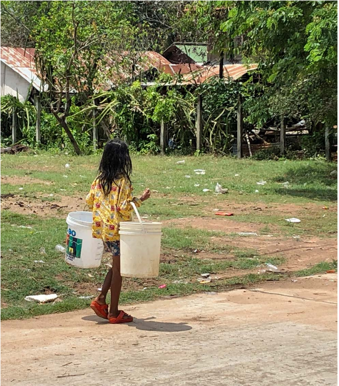
In low-income countries, girls often bear the responsibility for collecting water.